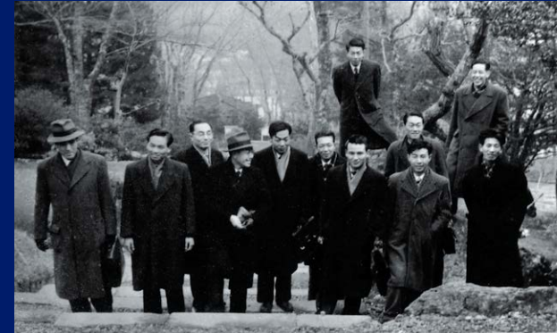
At the time of founding Nihon Kohden started with only twelve staff

We contribute to the world by fighting disease and improving health with advanced technology, and create a fulfilling life for our employees.